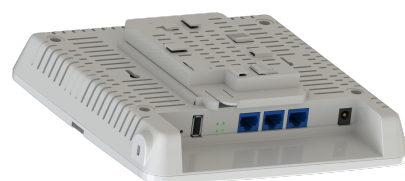
I/O Region (all models)